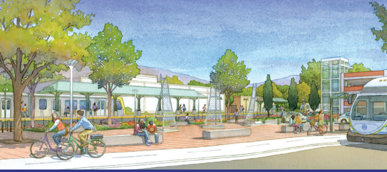
La Verne Station