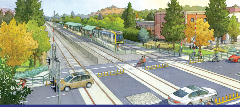
San Dimas Station