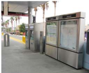
Ticket Vending Area