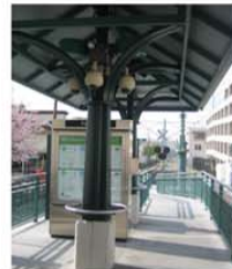
Closed Circuit TV Cameras for Security