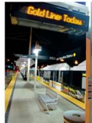
Variable Message Sign (VMS)