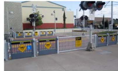
Pedestrian Grade Crossing Gates and Flabbers