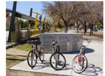
Bike Rack & Lockers