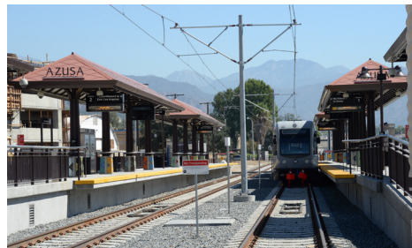
Azusa Downtown Station - Completed