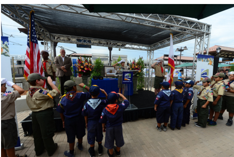
Monrovia Boy Scout Troop 141 and Cub Scout Pack 66 presented the colors at the Saturday, September 12, station dedication in Monrovia.