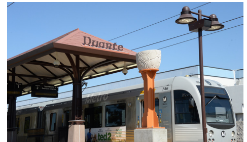
Duarte Station - Completed