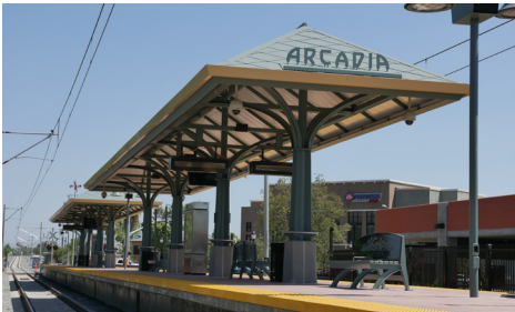
Arcadia Station - Completed