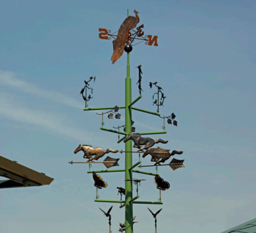
The weathervane sculpture, located on the station platform, addresses the natural phenomenon of light and wind.

Michael Davis' artwork, Arcadian Zephyr , is inspired by natural and designed elements from the City of Arcadia's major destinations: the race track at Santa Anita Park and the Los Angeles County Arboretum and Botanic Garden.