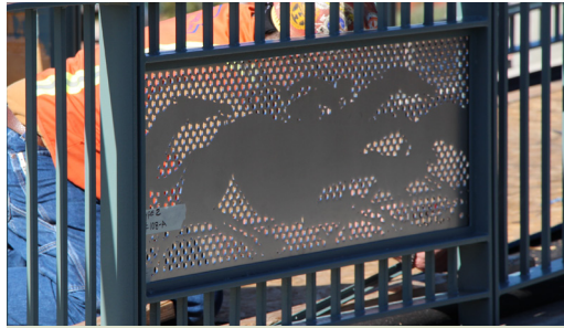
Inlaid panels of galloping horses on the ramp to the platform.