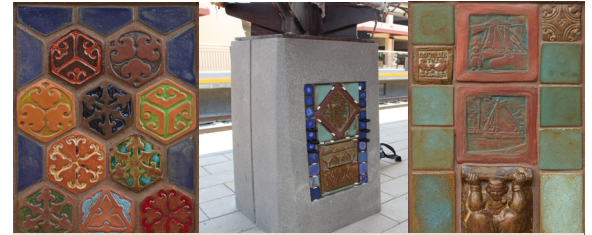
The station platform column bases are lined with decorative relief tiles associated with the California Arts and Crafts Movement.