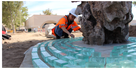
A sculptural rock carved by flowing water over hundreds of years and a glittering stream made from tiny, reflective glass triangles will greet passengers.

Cha-Rie Tang's art design reflects the sense of passing by mountains and streams in her "River of Time" theme. She also celebrates the Craftsman-style era common in the Foothill communities with one-of-a-kind tilework placed on the bases of the station canopy columns and the entrance ramps.