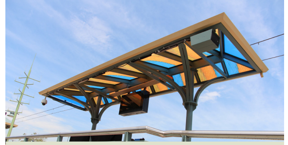
Peacock-inspired glass canopy over the ticket vending machines.