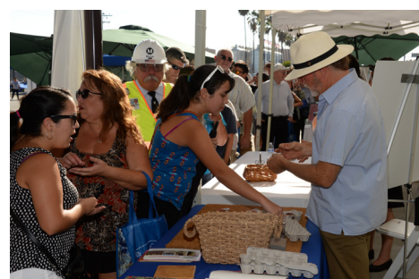
Community stakeholders visited the artist's booth at the Irwindale Station Dedication on Friday, August 28.