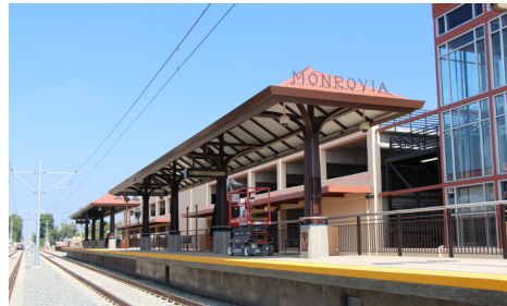
Monrovia Station - Completed