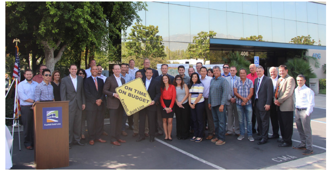
Construction Authority staff were joined by FTC, board members, consultants and Metro representatives at the signing of the Substantial Completion Certificate on September 23, 2015.

On September 24th, Metro accepted the Pasadena to Azusa segment and pre-revenue service was initiated. Pre-revenue service is an important period when Metro will continue to accept and commission new light rail vehicles, train operators and local emergency responders, and educate the community about staying safe as the trains begin to run regularly through their communities. Metro has recently announced a start date for passenger service - Saturday, March 5, 2016.