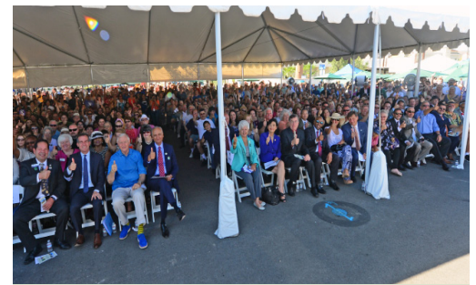
Thousands of community members and elected officials came out to dedicate the six new Foothill Gold Line stations.