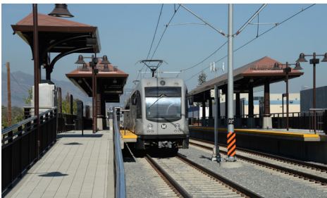
Irwindale Station - Completed