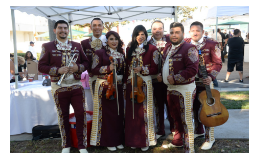
Along with the Azusa Aztec Band and Pageantry Corps and Azusa Cheer Squad, Mariachi Camino Real entertained the attendees at the dedication for both Azusa stations on Saturday, September 19.

Go to www.foothillgoldline.org and sign-up to receive E-News updates.