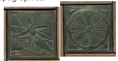
Pavers placed on the station platform include low-level reliefs depicting orange blossoms, branches and fruit imagery derived from the colorful crate labels used in decades past by the local citrus industry.

The artist team of Andrea Myklebust and Stanton Gray Sears was inspired by the idea of who has traversed and benefitted from the rich Duarte area landscape over the centuries. They chose four visual elements representative of the area to hand-carve in relief form on each of the limestone capitals topping columns at the station and parking lot. They include a topographical map of the area, California Live Oak leaves, basket-weaving image derived from the Gabrielino-Tongva peoples of the area and an intricate saddle design borrowed from the traditional Mexican leather carving as a tribute to Mexico's history and influence in the area.