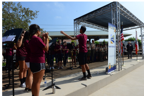
Attendees at the Arcadia Station Dedication were entertained by the award-winning Arcadia High School Band. Hundreds attended the Saturday, August 22, event.