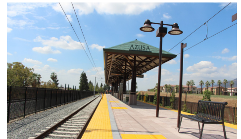
APU/Citrus College Station - Completed